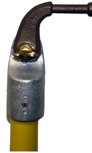
CLOSE-UP: Universal Head with Disconnect Stick Adapter.

Universal sticks feature a high-quality, foam-filled, fiberglass reinforced plastic core providing maximum insulation and mechanical strength. They are light-weight and easy-to-handle with a hard-gloss, porosity free bright safety yellow finish which is easy to clean; won't chip or peel.