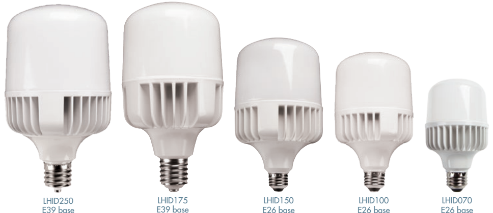
LHID250 E39 base