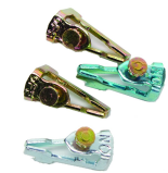
156T1978A Extra/replacement trippers 1 ON and 1 OFF