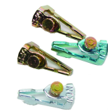
156T1978AD12 12 Pack of 156T1978A Trippers for T100, T7000, and WH40