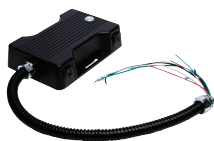
EM Wide Beam Ang Canopy (65-633)