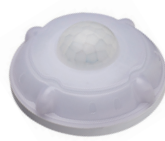
PIR Sensor/6 Meter (86-217)