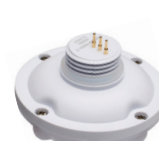
PIR Sensor/12 Meter (86-220)