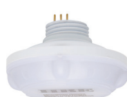
Microwave Sensor (86-218)