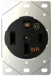
50A Weather-Resistant Electrical Outlet for EV Chargers (3894WREV)