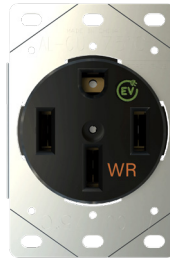
50A Weather-Resistant Electrical Outlet for EV Chargers (3894WREV)