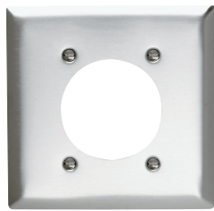
Power Outlet Receptacle Opening, Stainless Steel (SS703)