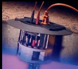
Open Space Systems