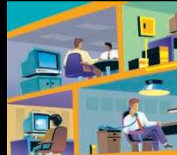
Power and Data Quality Systems